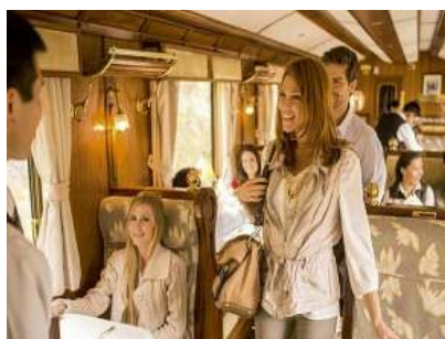
HIRAM BINGHAM TRAIN